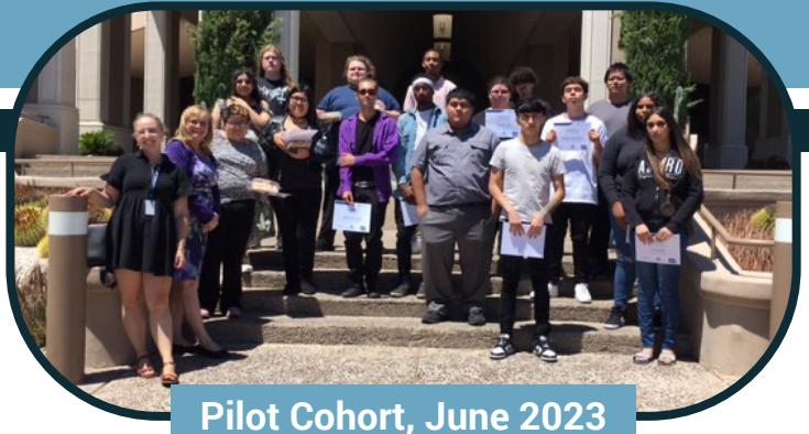
Pilot Cohort, June 2023

The Essential Skills Workshops offer holistic, youth-centered professional development opportunities for Opportunity Youth to gain essential soft skills and exposure to high-demand career pathways in Pima County.